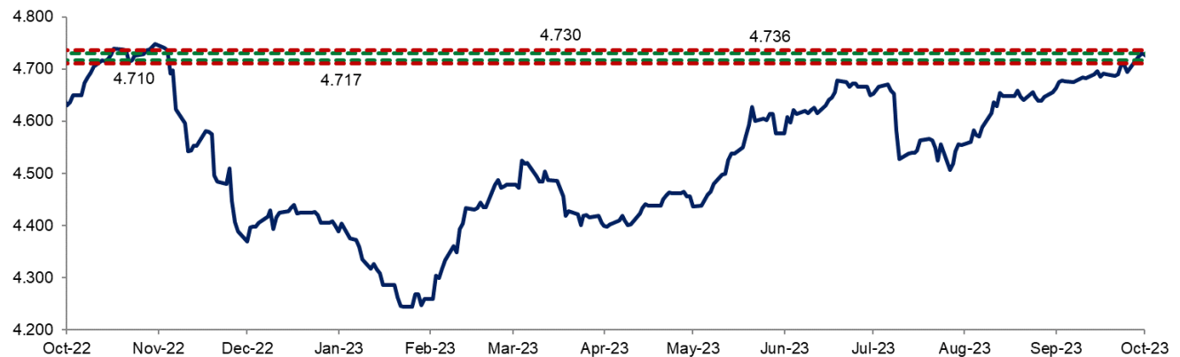
Graph 1: USDMYR Trend